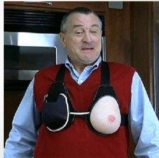
Father in law???